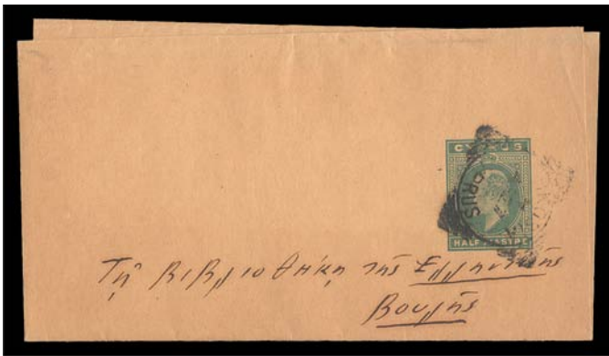
2243 ✉ WRAPPER, 1/2 pi. posted to Athens. VF. . . . . 15