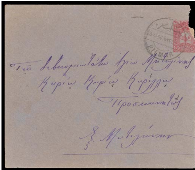
2094 COVER to Mytilene, with 20 pa. printed stamp, cancelled with bilingual "PILMAR". F. . . . . 35

Η ΔΗΜΟΠΡΑΣΙΑ ΘΑ ΓΙΝΕΙ ΣΤΟ ΞΕΝΟΔΟΧΕΙΟ: CROWNE PLAZA THE AUCTION WILL TAKE PLACE IN: ATHENS CITY CENTRE 40, MICHALAKOPOULOU Str. - ATHENS 115 28 - GREECE, Tel. +30-210.72.78.000, Fax. +30-210.72.48.187