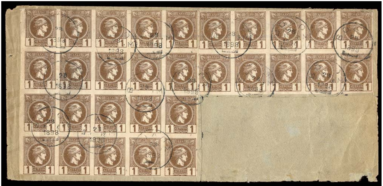
1112 Cover from Volos to Rotherham, franked with 1 lep. (VI. 117), in B20 and B10. Arrival cds Rotherham Ju.14. The address is cut off but R . . . . . 2000